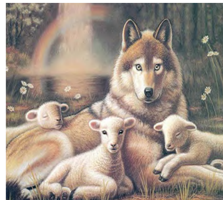
"The wolf will live with the lamb..." (Isa. 11:6)

"But in the last days it shall come to pass, that the mountain of the house of the Yahweh (the LORD) shall be established in the top of the mountains, and it shall be exalted above the hills; and people shall flow unto it. And many nations shall come, and say, Come, and let us go up to the mountain of the Yahweh (the LORD), and to the house of the God of Jacob; and he will teach us of his ways, and we will walk in his paths: for the law shall go forth of Zion, and the word of the LORD from Jerusalem. And he shall judge among many people, and rebuke strong nations afar off; and they shall beat their swords into plowshares, and their spears into pruninghooks: nation shall not lift up a sword against nation, neither shall they learn war any more. But they shall sit every man under his vine and under his fig tree; and none shall make them afraid: for the mouth of the Yahweh of hosts hath spoken it. "